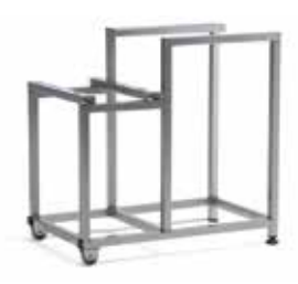
Stand - trolley