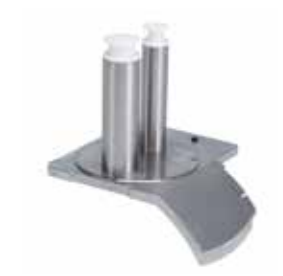
Long vegetable attachment