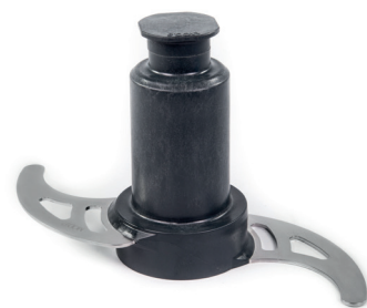
Hub with perforated blades