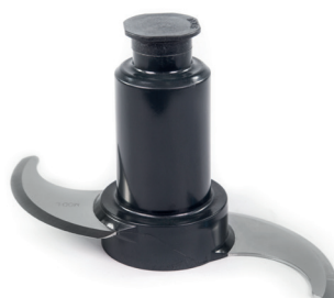
Hub with smooth blades