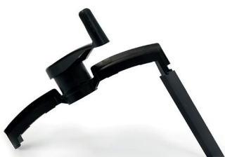
"Cut & Mix" scraper